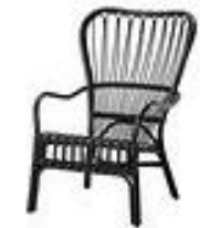
STORSELE black chair easy chair option 2