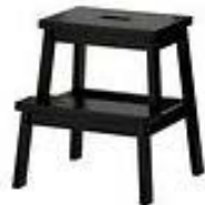
BEKVAM black step stool

IMPORTANT ELEMENTS IN INTERIOR STYLING / DESIGN Attic space has a good line, form for interior space. Keep in mind this area is usually small than any average room, so the key for styling is aimed to enlarge the space. The shape of a space Furniture / furnishings and floor coverings style Lighting design and styling Colour planning Decorative / accent items style