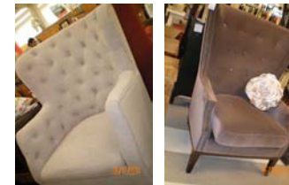
BUTTONED WING CHAIR Mocca or natural cream An option to substitute KNOPPARP loveseat

FURNITURE & ACCENT ITEMS Stockist Tjmaxx in MA, wayfair.com walmart.com, ikea.com, lampusa.com