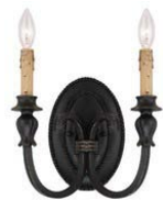
CHESAPEAKE two lights Wall sconce