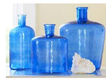
GLASS BOTTLE in blue decor item