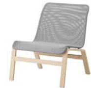
EASY CHAIR Grey with wooden leg