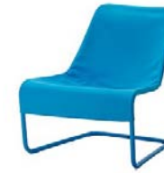
STORSELE blue tone Easy chair option 1