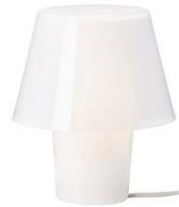
GAVIK white Table lamp