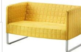
KNOPPARP yellow loveseat contemporary