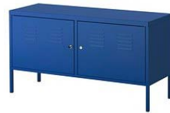
PS CABINET blue