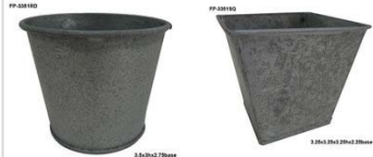
CHEUNGS round or square garden galvanised pot

IMPORTANT ELEMENTS IN INTERIOR STYLING / DESIGN Attic space has a good line, form for interior space. Keep in mind this area is usually small than any average room, so the key for styling is aimed to enlarge the space. The shape of a space Furniture / furnishings and floor coverings style Lighting design and styling Colour planning Decorative / accent items style