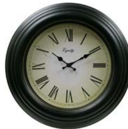
LA CROSSE technology Equity Antique Clock