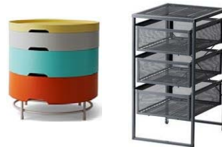
PS2014 Storage table multi colour & unit LENNART drawer multi drawer Storage & decor item